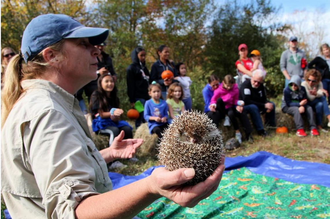
The "Critter Show"