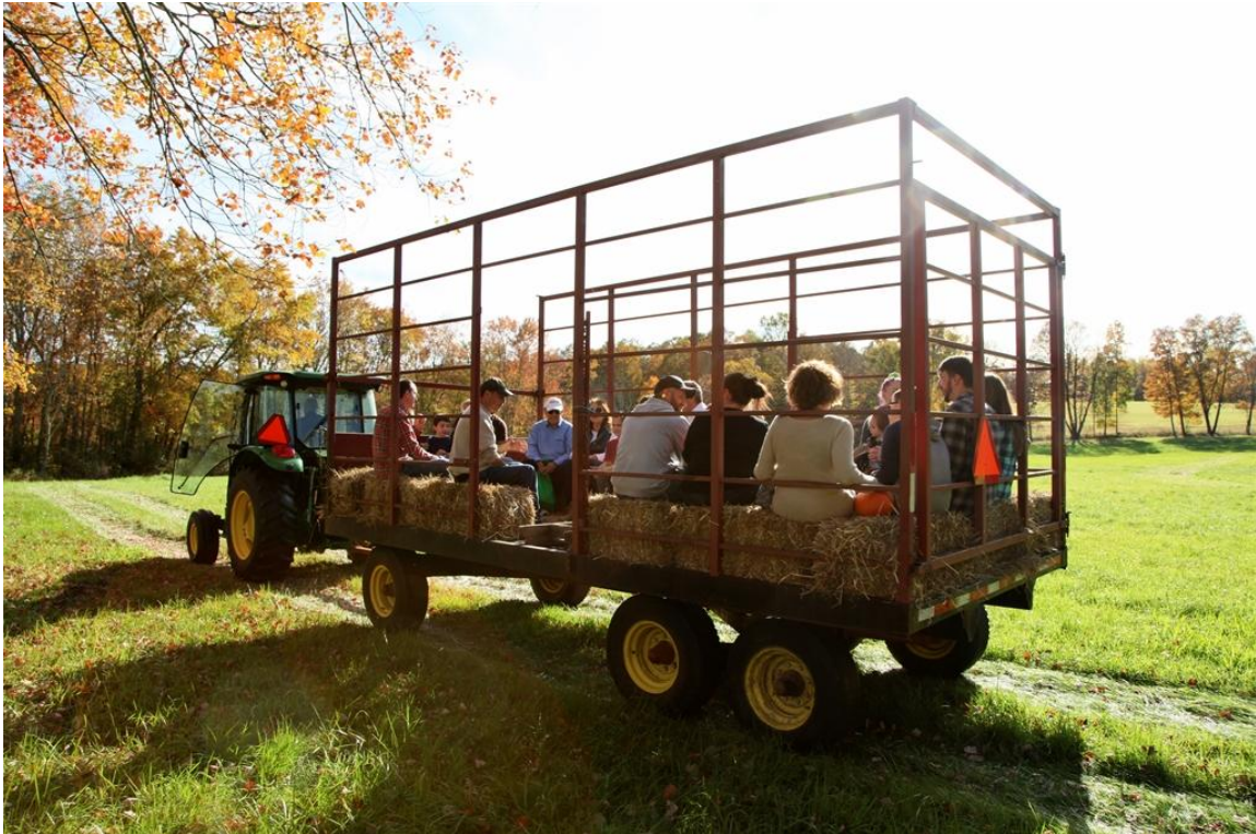
Hayrides at Phillips Farm