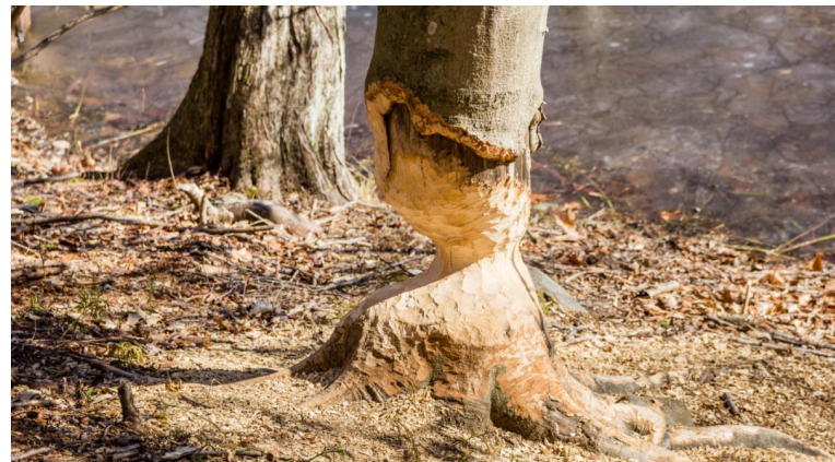
The ponds edge at the Bassett Preserve