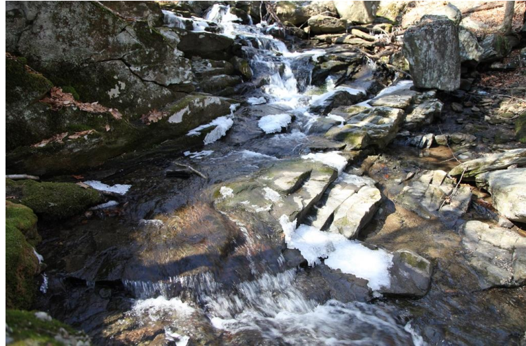
The rocky ravine at Koons Preserve

The Koons Preserve is home to Spruce Brook, a part of the Pomperaug Watershed. The brook drops 170 feet as it flows through the property. Views of the brook and rocky ravine are best this time of year.