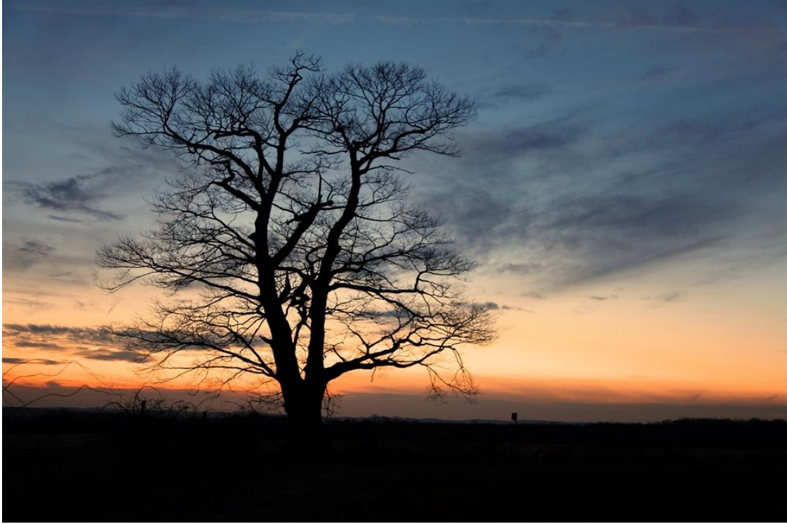
A February sunset silhouetting a lone oak tree at Southbury Farms.

Southbury Land Trust | 203-264-4441 | www.southburylandtrust.org