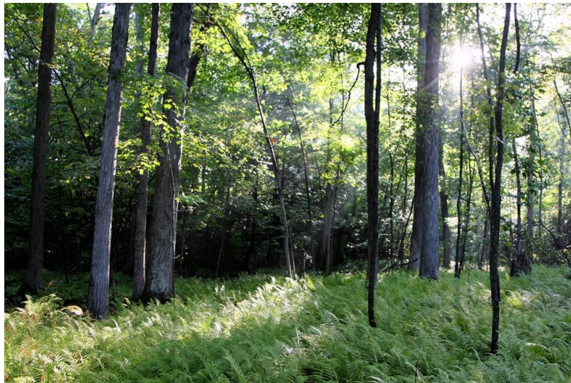
A view of our Fox Hollow Preserve, the last to be reopened.